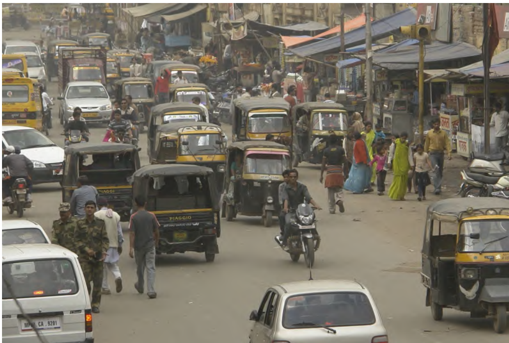
Figure 2. “People are able to use their commonsense understanding of the world ... to act sensibly in all sorts of new situations.” Yibiao Zhao.

Figure 2 shows a traffic environment where a traffic pattern may be difficult to identify and commonsense is essential.