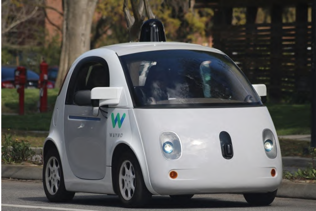
Figure 1. A self-driving car on the road in Mountain View, California