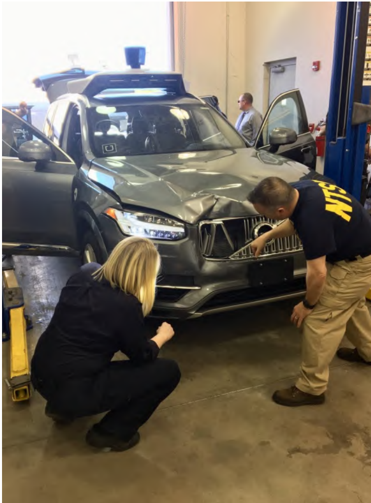
Figure 5. National Transportation Safety Board employees examine an Uber autonomous car involved in a fatal crash in Tempe, Arizona.

Illustrations of the political risk were common in the months following fatal SDC accidents involving Uber in Arizona and Tesla in California in 2018. See Figure 5. After these accidents, a US Senator wanted “to ensure semi-autonomous cars are also included in [an SDC-related] bill, that there are requirements for all of the vehicles to have a manual override and that there is more transparency with the data and safety evaluations” [50]. A Consumers Union specialist on SDCs, commenting on the bill, said, “We want to make sure that data is broadly shared to demonstrate their safety before the rest of us have to be guinea pigs sharing the road” [50].