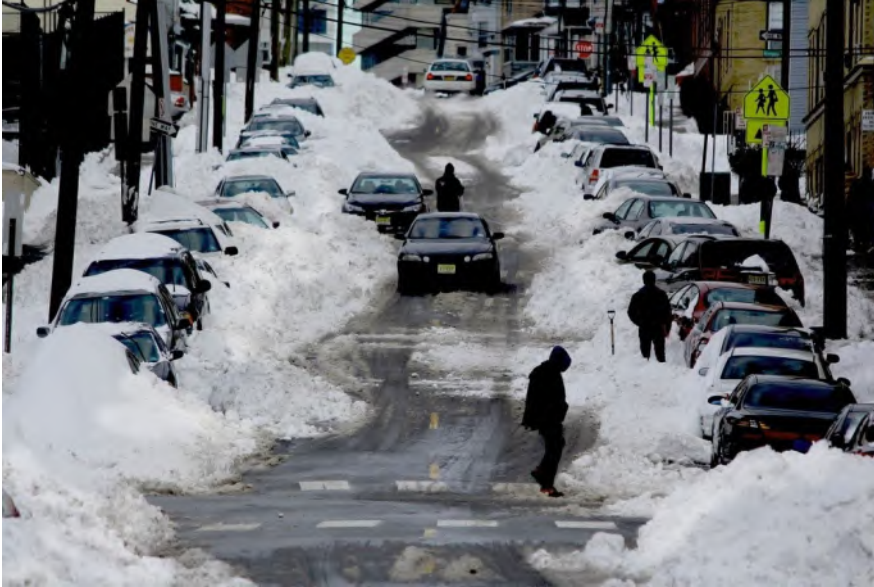
Figure 4. Shoveling out after a heavy snow

Cleaning the snow and ice from and around a car after a heavy winter overnight storm can take substantial time. Currently, Lyft and Uber avoid this problem because their drivers double as snow-removers, cleaning their own vehicles of snow and ice or keeping them in their own garage. But robotaxis will not have drivers, and thus a robotaxi company will have to keep a significant number of employees available at short notice for part-time snow removal work—after a snow or ice storm hits the area. This requirement will raise the cost of the robotaxi service in addition to being difficult for managers to administer.