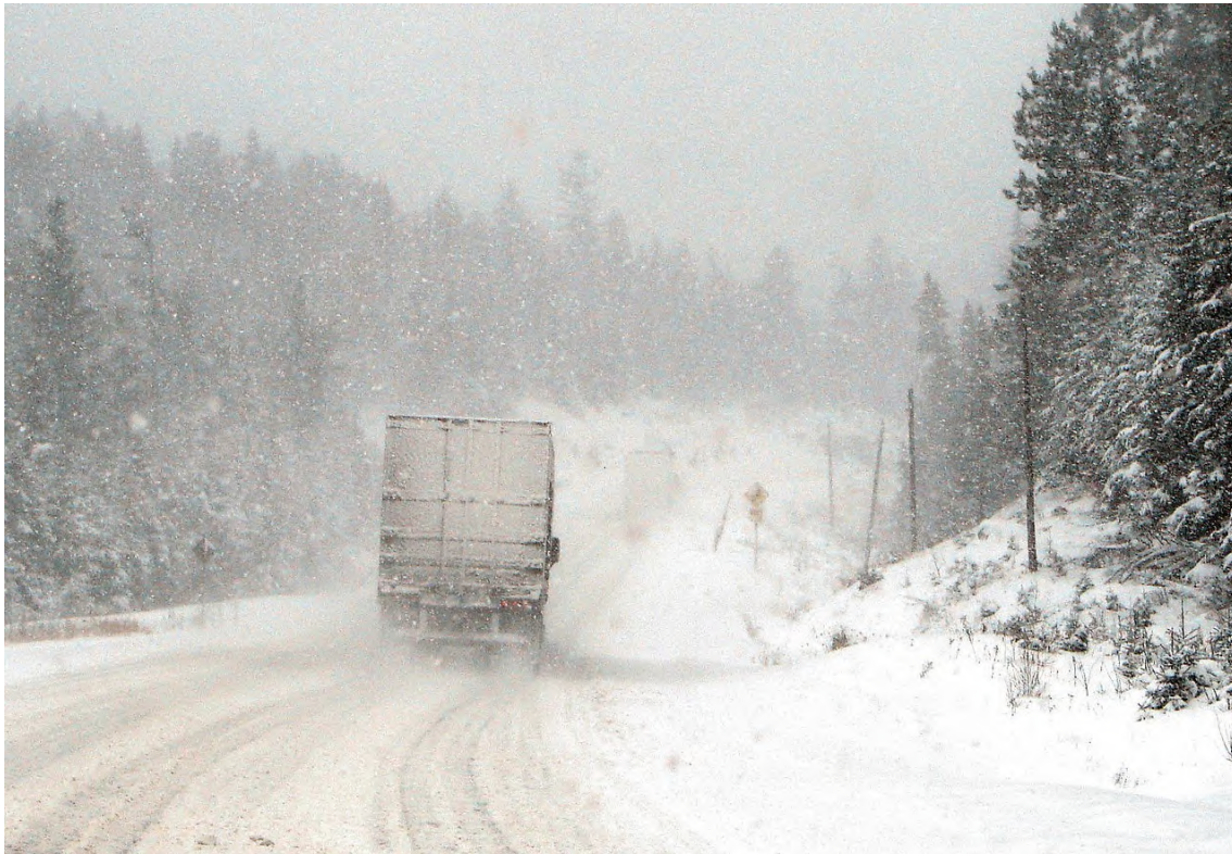
Figure 3. Small clouds of snow, ice, and slush thrown up by truck tires

Extreme weather conditions create several problems for sensors. Figure 3 illustrates one of them—the vulnerability of sensors to being obstructed by snow, ice, and slush thrown by other vehicles.