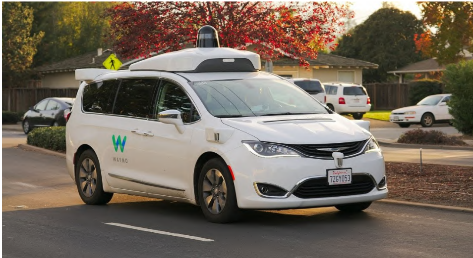
Figure 6. Waymo Chrysler Pacifica Hybrid minivan used as robotaxi in Chandler, Arizona.

Fleets of robotaxis and delivery vehicles are usually mentioned as the first applications of SDC technology to general-purpose driving. Ford is launching a fleet of pizza-delivery vehicles in Miami. Ford and GM plan to launch fleets of robotaxis in various cities, and Waymo already has [Figure 6].